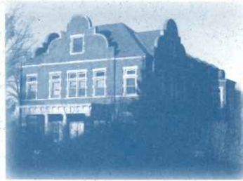
Pennhurst Center features Dutch Colonial Revival architecture

See and learn the fascinating history of a forgotten institution. In 1908, "The Eastern Pennsylvania State Institution for the Feebleminded and Epileptic," opened its doors to men, women and children from all over the state. A self-contained community of Colonial Revival style buildings and surrounding farmland, the Pennhurst Center (as it was renamed in 1923) served thousands of patients until it was closed in 1987. Today, this deteriorating complex which sits on a hill overlooking the Schuylkill River, awaits its chance for adaptive reuse in the 21st century.