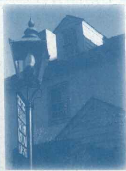
Coventry Forge, an 18th century social center in William Penn's back country