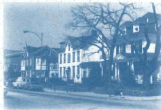
Historic streetscapes abound in Chester County's only city