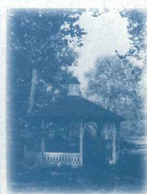
Repose in the gazebo to capture the mild cooling of summer breezes