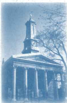
Chester County's Greek Revival Court House

It has been 150 years since the Chester County Court House, designed by Thomas U. Walter, opened on George Washington's birthday, February 22, 1848. Begin your June 4 evening with a tour of the Court House—you will see mid-nineteenth century features and the handsome court rooms without being a prisoner in the docks. Then our guides will conduct a variety of walks—your choice—about the downtown and the fine northwestern streets of West Chester, with varying mixtures of social and architectural history. Many coffee-houses and restaurants await you.