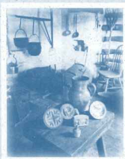
The interior of Downingtown Log House