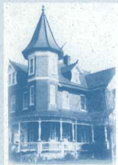
Queen Anne Revival home at the intersection of Pine and Maple Streets