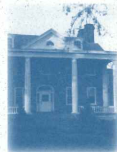
Architecture in the complex spans numerous decades