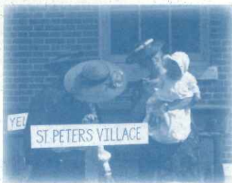
People are the life of this quaint Victorian industrial village