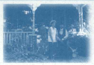
Hearts and hosta reflect a bygone era