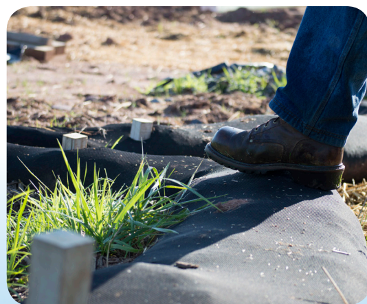
Compost-filled mesh socks help to control erosion and retain sediment in construction areas. These erosion controls trap sediment and pollutants, while allowing filtered water to pass through.

Sunoco Pipeline is dedicated to providing project information and construction updates to residents and local officials in the communities where we live and operate our Mariner East system. This regular publication will provide project updates; interested recipients can sign up at www.marinerpipelinefacts.com .